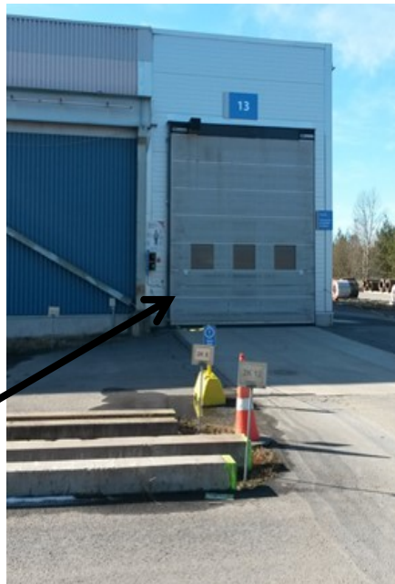
unloading hall, door

NB! Movable stairs must be used at the unloading area when going to and leaving the platform!